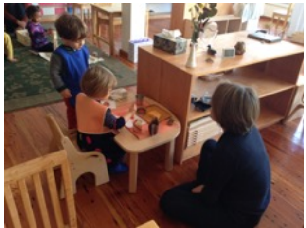
When I paint with water colors I follow a process that engages my mind and hand!

We have furthered our investigation of autumn leaves through the classification -or parts of- a leaf! Crayon rubbing provided an artistic means to studying the veins and margins of the numerous leaf-shapes we have discovered in our neighborhood. These interesting occupations give each child the opportunity to make a choice to do something purposeful throughout the day. Each choice a child makes in his/her daily life adds to the development of the child’s will. The will is strengthened through practice.