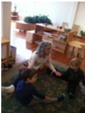
When I visually discriminate the red rods my whole body is engaged in the activity!