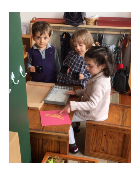
Practicing writing letters with the sand tray and sharing a cup of orange juice!