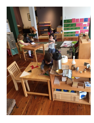
Lots of activity in Violeta