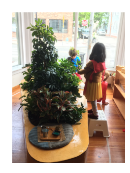
We are so in tune with life around us. The summer has sparked our interest in plants and insects in Violeta