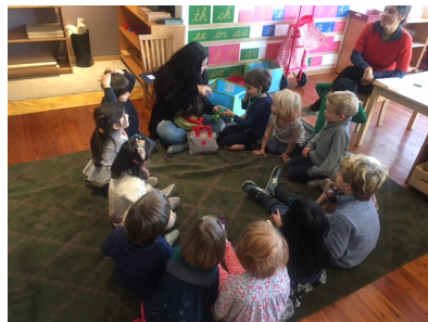
...y el doctor dijo "no mas monos brincando en la cama!"