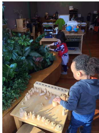
After I match each cylinder to the corresponding socket, I can do it again, and again, and again! Such satisfaction in this work.