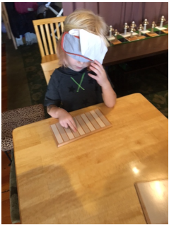
The rough and smooth boards call to me to stroke the alternating textures; rough, smooth, rough, smooth...

-Dr. Maria Montessori, The Absorbent Mind