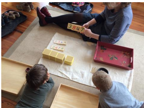
Putting it all together: thousand cubes, hundred squares, ten beads and unit beads. This is called addition!