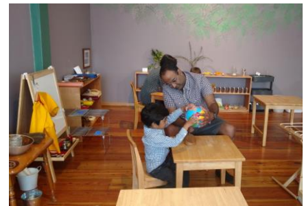
Our fascinating Earth, another favorite during Parent Friday!