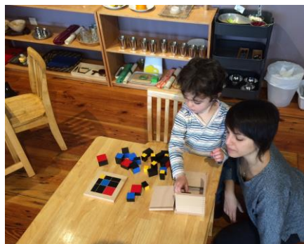
The trinomial cube stretches my imagination!