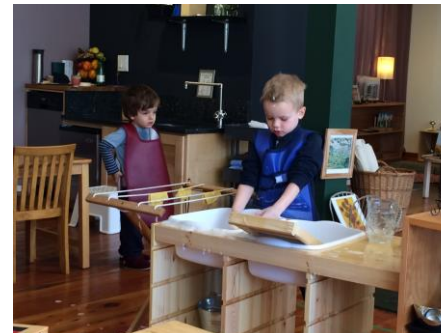
Bubbles and foam, a point of interest in linen washing!