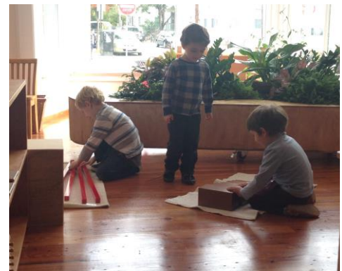
"With the red rods I am learning to distinguish changes in length and through my work with the brown stairs I am distinguishing width!"