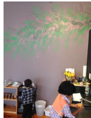
Our Ferns on the back wall