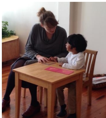
"Ssss,, like Sangididi!"