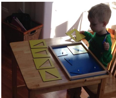
"The geometric shapes help my hand develop fine motor control through holding the knob and tracing the shapes! I am using my senses to absorb the characteristics of the shapes!"