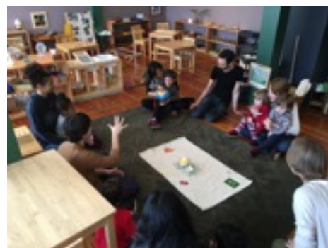
We celebrate each life because everyone is important and has a story to share!