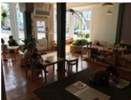
I like showing my parents what we learn and how we work in Violeta!