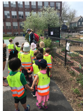
Walking to Squirrel Brand Park and finding insects is my fascinating work!