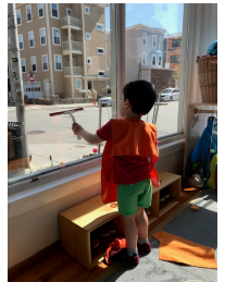
These windows are part of MY classroom: my work is to take good care them & everything in MY classroom!

This week the Teacher Leaders discussed how to move the children's Violeta classroom to a higher level. To do this we listened to the language we carefully choose that respects the child and provides consistent expectations. The words encourage the children to be independent, intrinsically motivated critical thinkers.