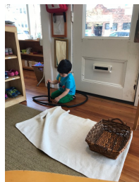
Only I can do my work: independently I move my arms & hands precisely to complete my BIG work!