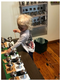
Pairing the tones of the bells is satisfying!