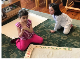
I do real work because it engages my mathematical mind!