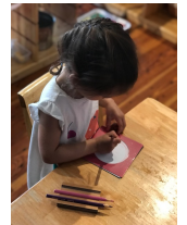
Violeta's calm environment is perfect for me to work undisturbed & free from distractions!

Living into Violeta's Principle of a seamless learning community, connecting home and Violeta, we invite you to use the language that will give daily support to the growth and development of all our children in Violeta.