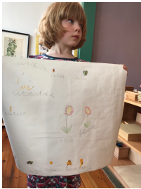
Work is what I do to express what I know in a creative activity!