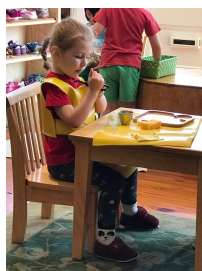
Polishing the howler monkey from Costa Rica is my joyful work!