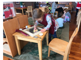
Real work engages my mind, my hands, and my whole being!